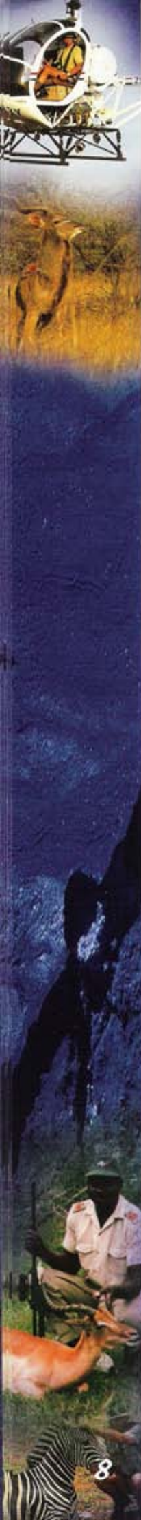
Model PICO 2