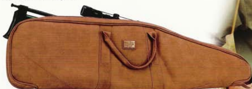
Specially produced soft transport cover for mod. JM Standard.

The DAN-INJECT JM STANDARD model represents a radical departure from previous injection rifle design. With an overall length not longer than the barrel, the JM STANDARD is an extremely compact rifle which offers many practical features. The new design maintains the established DAN-INJECT reputation for reliability and accuracy, which the JM STANDARD rifle continues to deliver over normal darting distances. The rifle is of very robust construction with a synthetic covered barrel, carrying handle and shrouded manometer. As the manometer and telescopic sight can be viewed simultaneously, pressure adjustment is rapidly and silently achieved without the operator losing sight of the target animal. All parts are manufactured of weather resistant anodised aluminium, and stainless steel fastenings are used throughout.