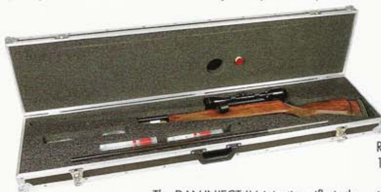
Robust custom weapon case 133 x 30 x 12 cm