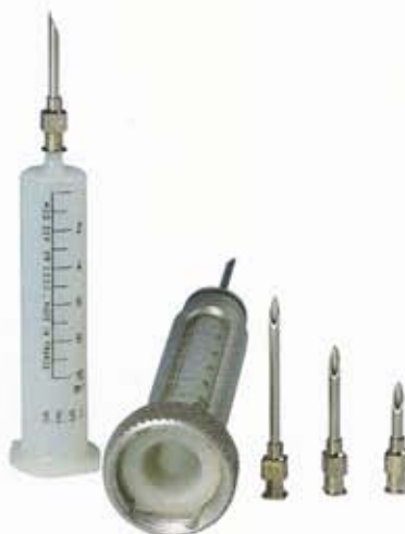
Multi-use nylon Jabstick syringes and specially produced injection needles.

CATS is an automatically discharging jabstick which injects 1 - 10 ml in one second or less on contact. It features an easily cocked trigger device that releases the injection on contact with the animal for safe, humane administration of vaccines or pharmaceuticals. The safety lock ensures safety for personnel. The CATS jabstick is 1 metre in length with a removable extension handle that increases the effective working distance to 2 metres. It utilises nylon multi-use luerlock syringes and all parts are manufactured out of weather resistant, stainless steel which is easily disassembled and cleaned. The DAN-INJECT CATS jabstick is especially useful in confined situations and underwater where absolute restraint is impossible. Also for use on cattle, horses, pigs, sheep, and in zoo applications.